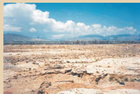
Tailings deposits in Subarea 4