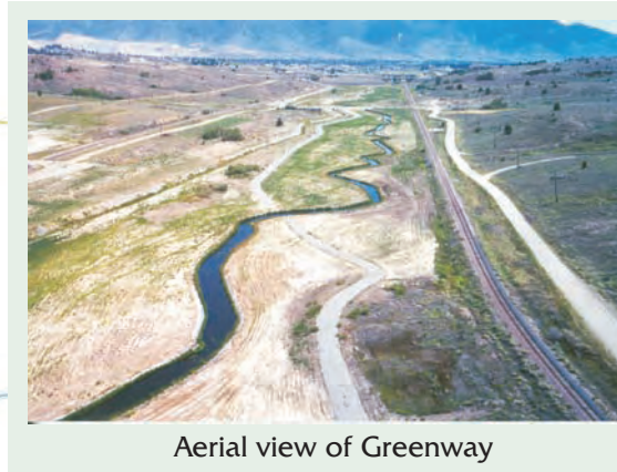
Aerial view of Greenway