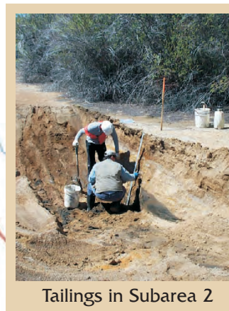
Tailings in Subarea 2